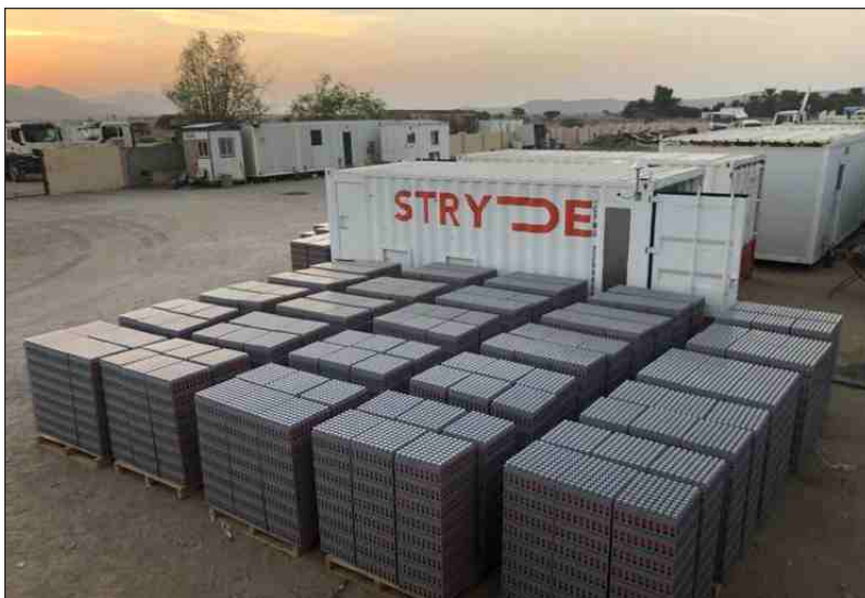
Figure 2 - 166,000 STRYDE nodes in Oman

In both scenarios, faster, less intrusive operations allow operators to maximise short weather windows and move more quickly from seismic acquisition to interpretation and